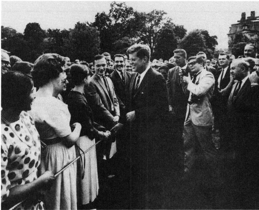
John F. Kennedy Library