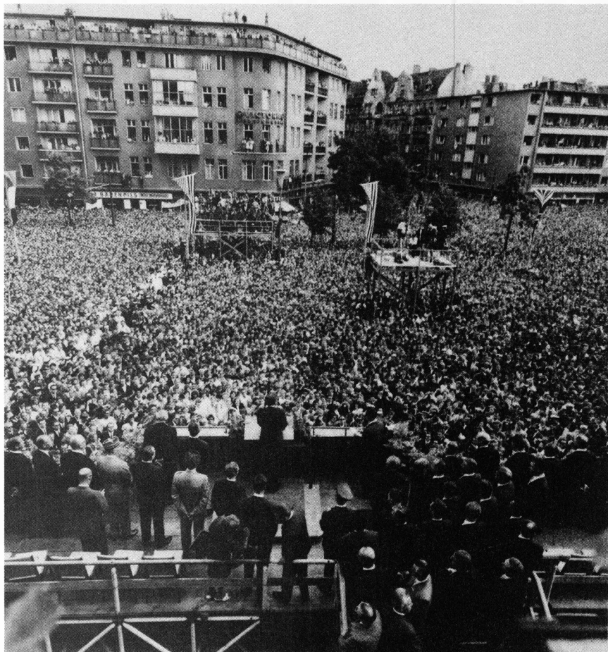
June 6, 1963: President Kennedy speaks at the Berlin Wall. " Ich bin ein Berliner! "

The movie JFK , began to unleash a huge controversy even before it started showing in movie theaters. The basic thesis of its director, Oliver Stone, is that Kennedy's assassination was a coup d'état by the CIA/FBI and parts of the military-industrial complex, and that the cover-up perpetrated by the Warren Commission was merely one more step in the formation of a "parallel government" in Washington and a turning of the United States toward fascism. This thesis has struck a raw nerve in the U.S. population and within the Establishment.