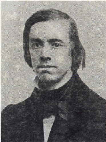
Thomas Starr King (1824-1864)

We are living for the future. It doth not yet appear what we shall be... True patriotism, therefore, which labors to keep a nation faithful to its mission, cannot be satisfied here unless the ideas of human worth and privilege that awakened and supported our political struggle, ripen and produce their finest spiritual fruit.