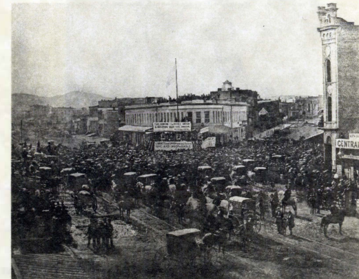
A Union rally led by Thomas Starr King during the Civil War. February 22, 1861 at the intersection of Post, Market and Montgomery streets